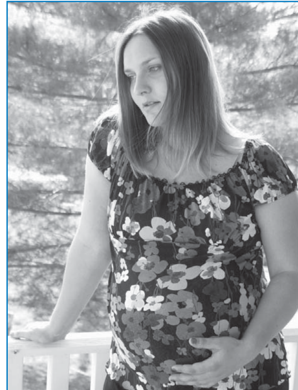
With services provided at Methodist Mission Home, Mary (not actual picture) found the perfect family to raise the child she was not ready to care for.