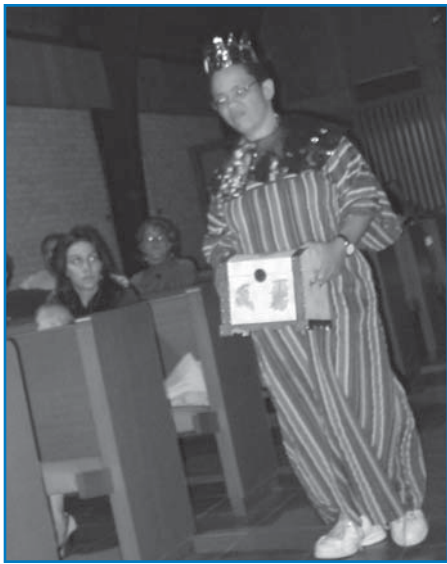
A client from HandsOn, a partner of Methodist Mission Home's Genesis Cooperative, plays one of the three Wise men during Las Posadas.

Las Posadas is a reenactment of the journey Joseph and Mary took in search of a place to give birth to Baby Jesus. Joseph and Mary are turned away at each stop before finding a safe haven in the form of a manger in Bethlehem.