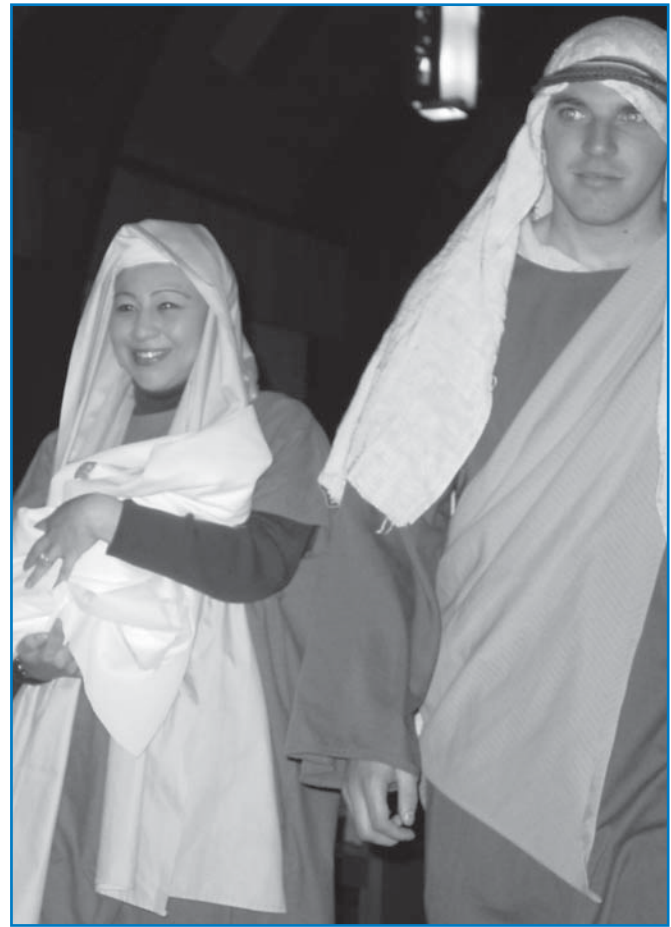
"Joseph" and "Mary" look for lodging in the MMH chapel during the annual Las Posadas event on campus.

For more information on the Genesis Cooperative visit www.mmhome.org .