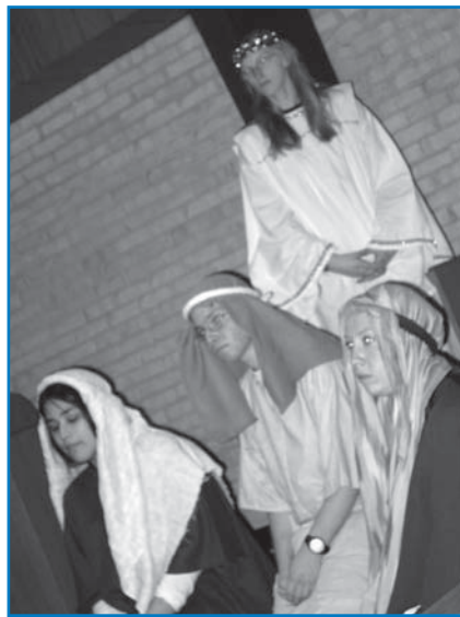
Friends of the L.I.G.H.T program, and students from the Southwest Center for Higher Independence play shepherds during the drama.