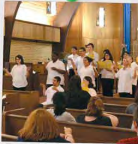
Signs of the Times Deaf Choir perform at the Chrismon ceremony in December at the chapel on campus.