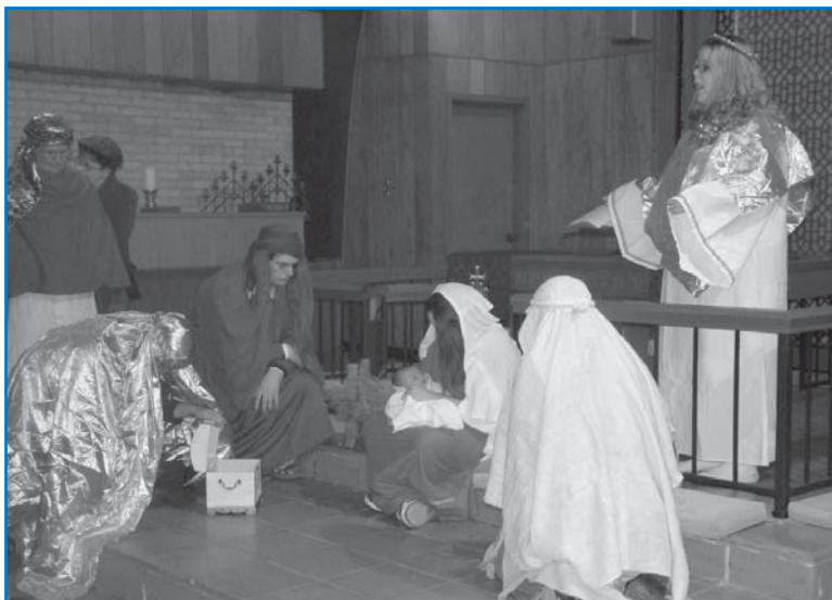
The Three Wise Men visit Mary, Joseph, and Baby Jesus while an angel sings majestically over them.