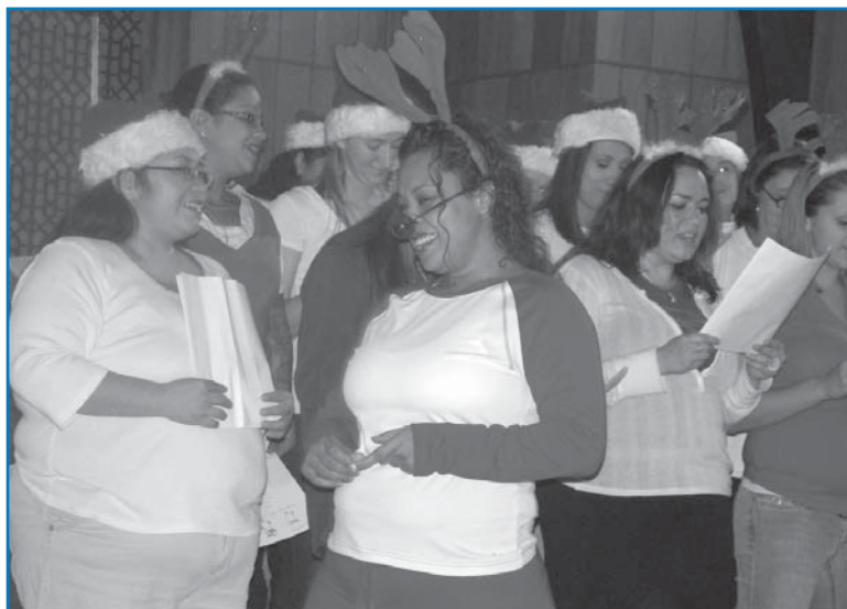
Women of Volunteers of America's L.I.G.H.T. program sing and dance to "Rudolph the Red-Nosed Reindeer" during the Christmas festivities.