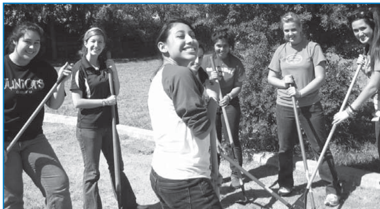
Volunteers from Incarnate Word High School work on smoothing out the walking trail on the Methodist Mission Home campus.

Blue Skies is the official newsletter of Methodist Mission Home. Your comments, suggestions and ideas for future issues are most welcome!